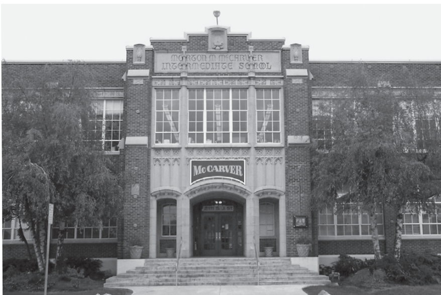
The data from the first year of this five-year program supports the proposition that stabilizing a family's home life can boost academic achievement.

The data from the first year of this five-year program offer preliminary support for the proposition the program seeks to test: that stabilizing a family's home life and keeping children continuously enrolled in the same school can boost academic achievement. Students whose families enrolled in the program showed more than three times the gains in reading test scores over key comparison groups, along with greatly increased housing stability, according to a newly