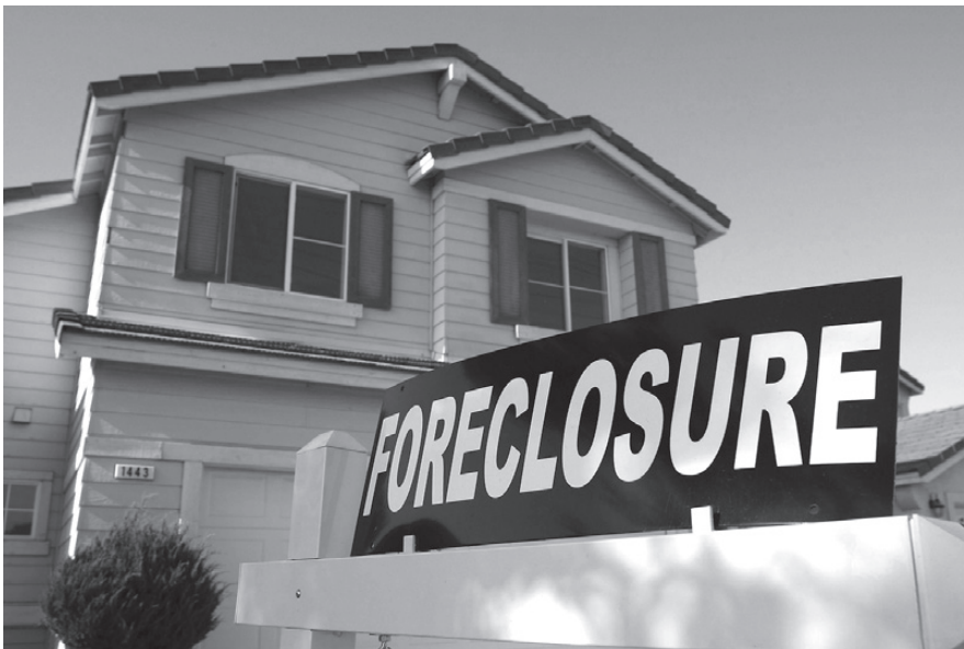
Some states are using their mortgage settlement payouts to bolster their budgets.

For example, Missouri lawmakers used most of their $39.5 million to