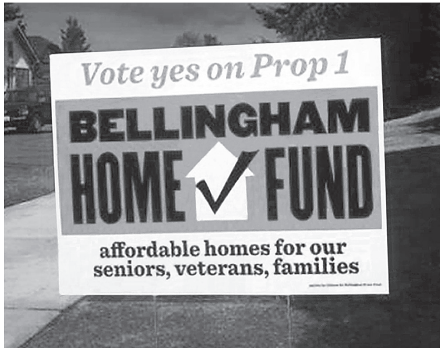
A tax levy to help provide low-income housing in Bellingham won handily with 55% voter approval.