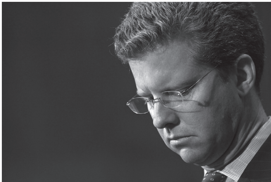
HUD Secretary Shaun Donovan. "Do we settle for a country where a shrinking number of people do really well, while more Americans barely get by? Or do we work together to build a nation where everyone gets a fair shot, does their fair share, and plays by the same rules?"

With Choice Neighborhoods, communities have the tools they need to address the capital needs of not just distressed public housing, but all kinds of HUD-assisted housing in a neighborhood. And by aligning those investments with the Department of Education's Promise Neighborhoods initiative it puts school reforms at the center of those efforts.