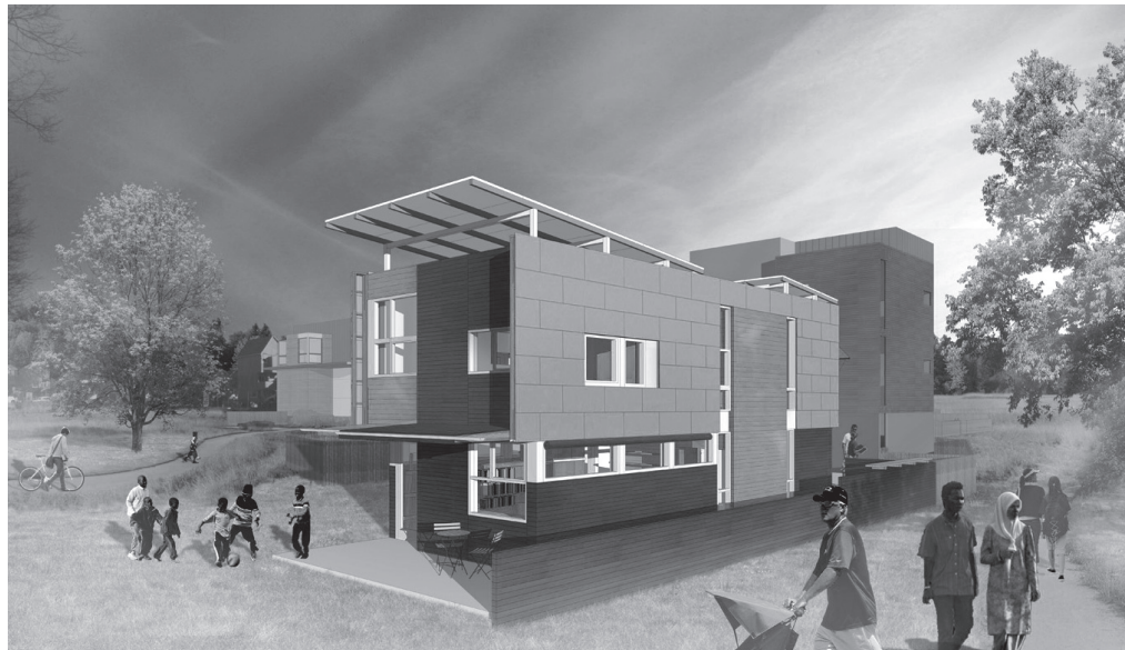
The two-story, 1,400-square-foot “House of the Immediate Future” will have elements that Habitat intends to use in future projects such as prefab “wet cores” for the kitchen and bathrooms. They will be manufactured by Method Homes and shipped to the site.