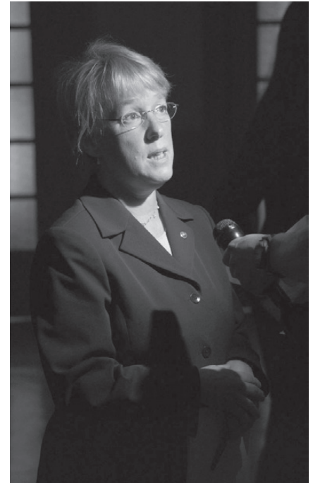
HUD Secretary Donovan on Senator Patty Murray. "Even as homeowners and renters begin to see the light at the end of the tunnel and emerge from this crisis, Senator Murray is focused on the broader challenges facing the families of Washington and the country."

Because we jumpstarted developments stalled by the economic crisis, we not only provided critical affordable housing during the crisis