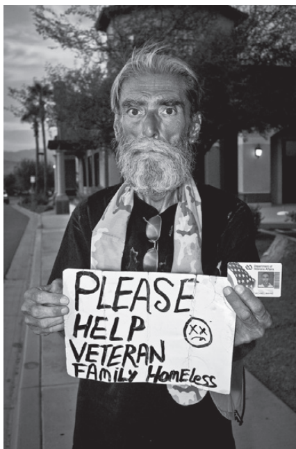
"We have more work to do and will not be satisfied until no Veteran has to sleep on the street."

On a single night last January, 633,782 people were homeless in the United States. HUD's annual 'point-in-time' estimate seeks to measure the scope of homelessness over the course of one night every January. Based on data reported by more than 3,000 cities and counties, last January's estimate reveals a marginal decline in overall homelessness (-0.4%)